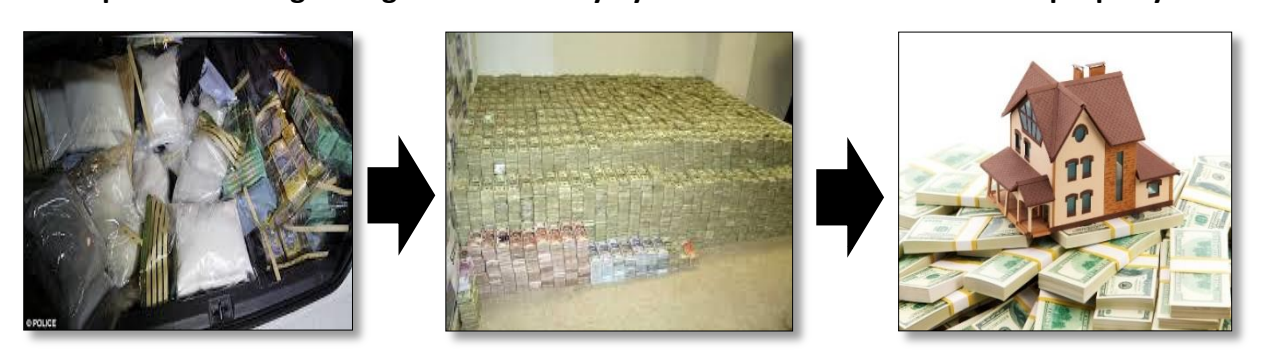
Crooks sells drugs for cash